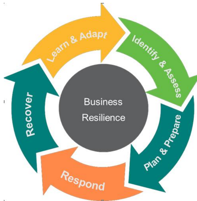
Figure 2. Critical Incident and Business Continuity Cycle